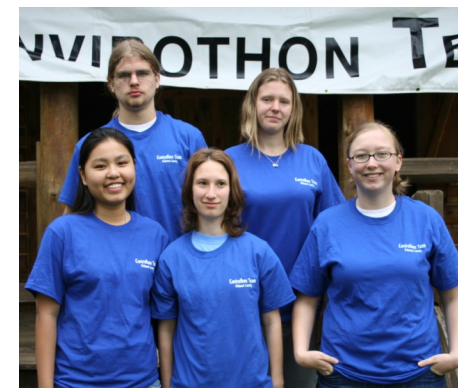
Olney Friends School