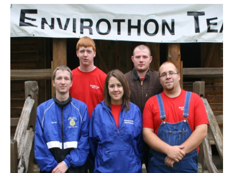
Union Local FFA