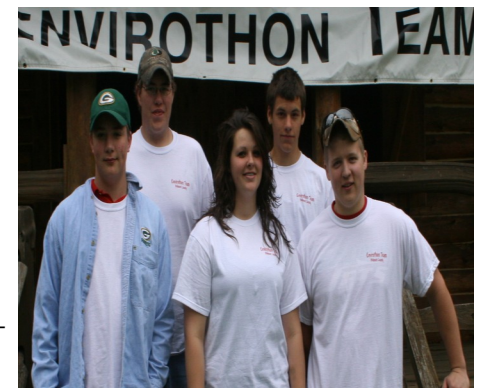
Union Local FFA