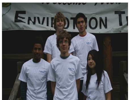
Olney Friends School

"Biodiversity in a changing World" was the theme for the 2009 Canon Envirothon. The Envirothon is designed to stimulate, reinforce and enhance interest in the environment and natural resources among high school students. It also encourages cooperative decision-making and team building skills. The students are tested in the areas of wildlife, aquatics, forestry, soils and current environmental issues. The Area 3 Envirothon was held on May 6, 2009, at Camp Muskingum in Carroll County. Fifty-four teams completed from a 16 county region.