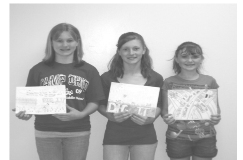
First Place Second Place Third Place

For additional information, contact Eric Gibson at 740-425-1100 ext.114 or gibsonswcd@comcast.net