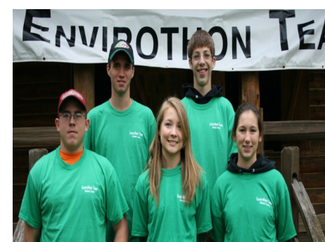
Barnesville High School

"Biodiversity in a changing World" was the theme for the 2009 Canon Envirothon. The Envirothon is designed to stimulate, reinforce and enhance interest in the environment and natural resources among high school students. It also encourages cooperative decision-making and team building skills. The students are tested in the areas of wildlife, aquatics, forestry, soils and current environmental issues. The Area 3 Envirothon was held on May 6, 2009, at Camp Muskingum in Carroll County. Fifty-four teams completed from a 16 county region.